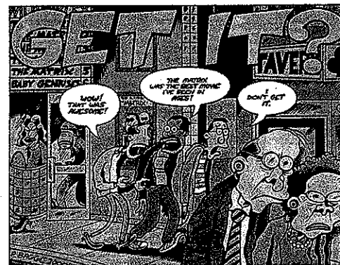
Fig. 3.1. Peter Bagge suggests how perplexing some viewers found The Matrix .

"You mean you were sitting there scratching your head through the whole thing?"